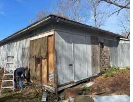
South-East Facade Details Corner