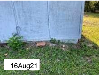
West Façade-Fleming Ave