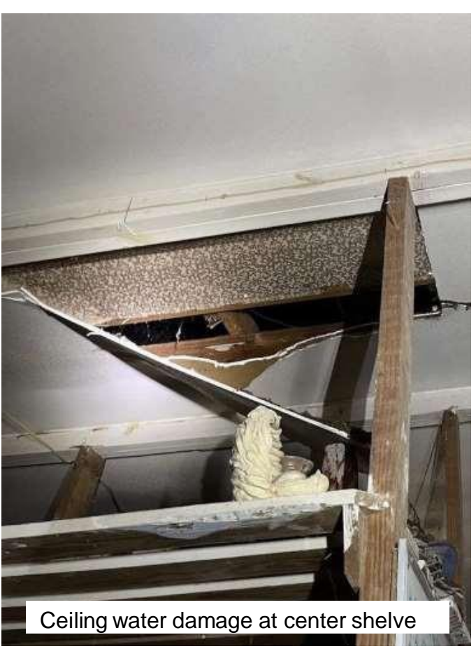
Interior Main Space