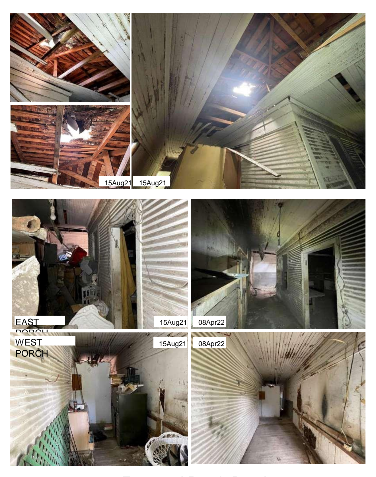
Enclosed Porch Details