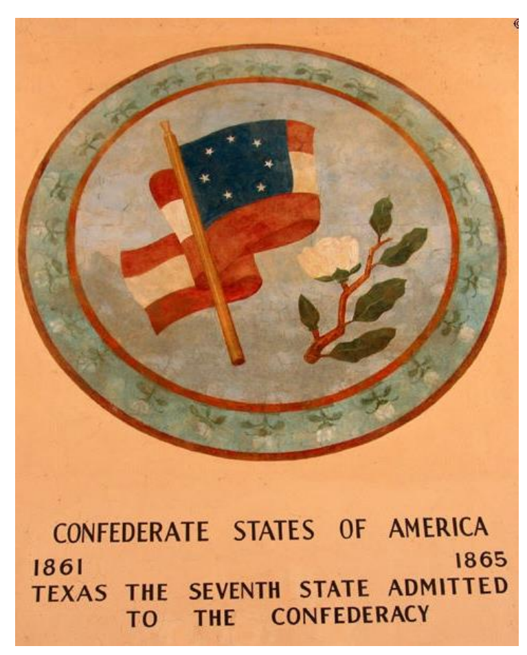
Confederate Roundel, 1936