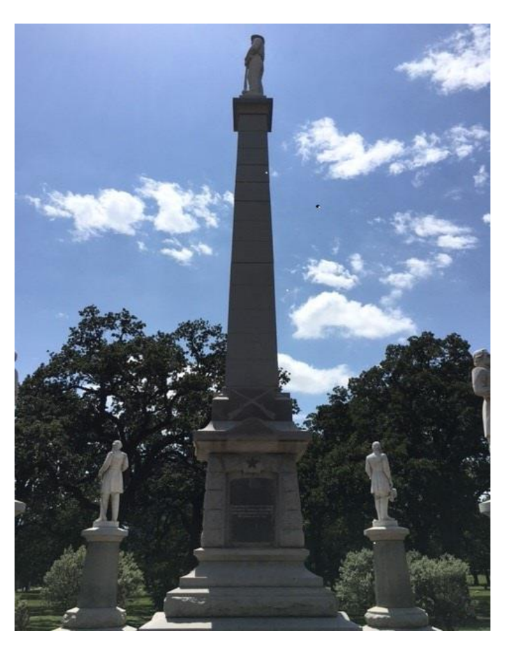
Frank Teich, Confederate Monument , 1896-97