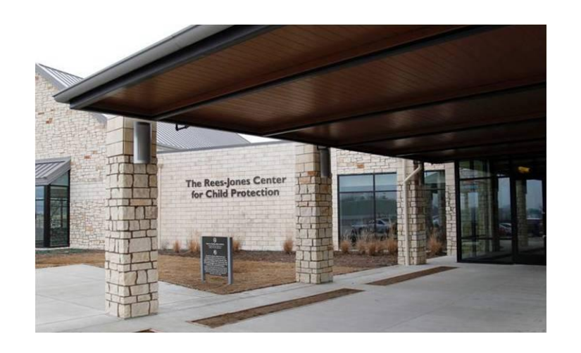
Dallas Children's Advocacy Center 5351 Samuell Blvd Dallas, Texas * Current Location