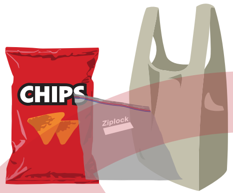
Plastic Bags & Plastic Film

When non-recyclables are mixed into the recycling bins, it can turn the whole container from recyclables to trash.