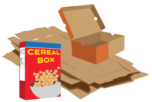
Cardboard & Boxboard