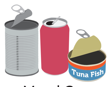
Metal Cans Aluminum, tin & steel