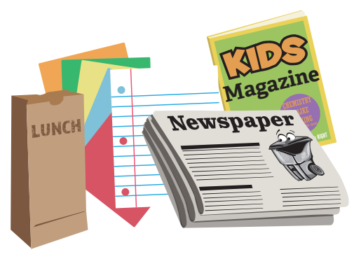
Mixed Paper Newspapers, magazines, junk mail, etc.