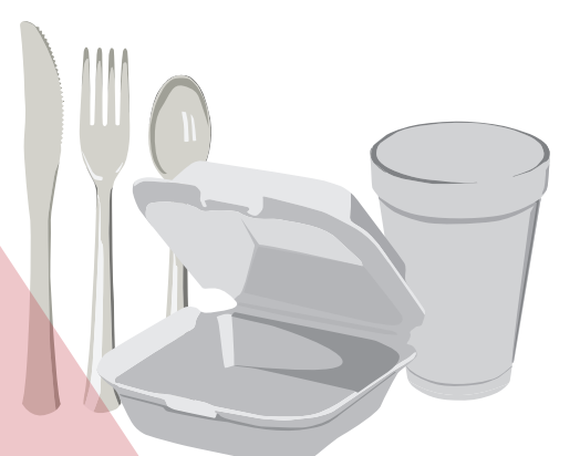
Styrofoam & Plastic Utensils