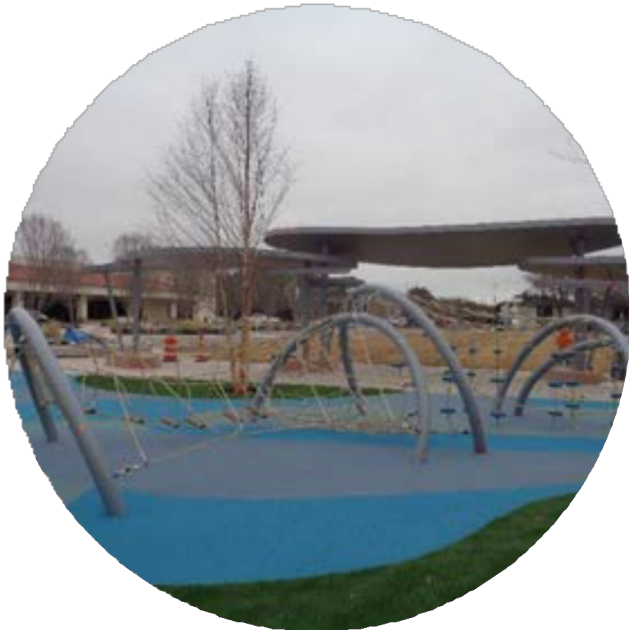
HILLCREST VILLAGE GREEN