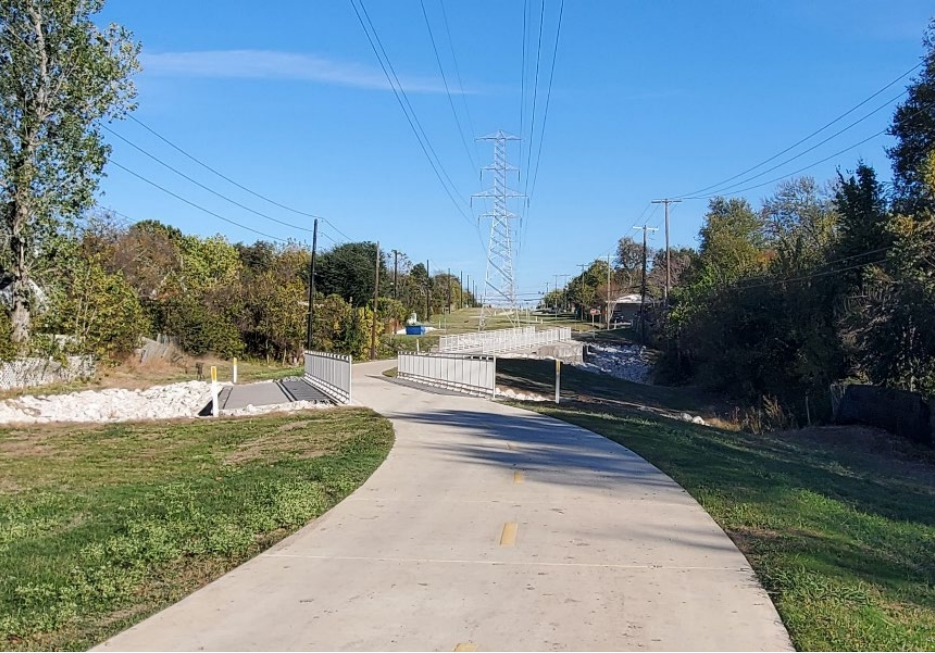
CEDAR CREST/HONEY SPRINGS TRAIL