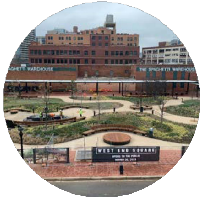
WEST END SQUARE