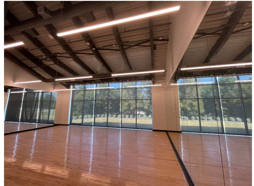
WILLIE B. JOHNSON RECREATION CENTER