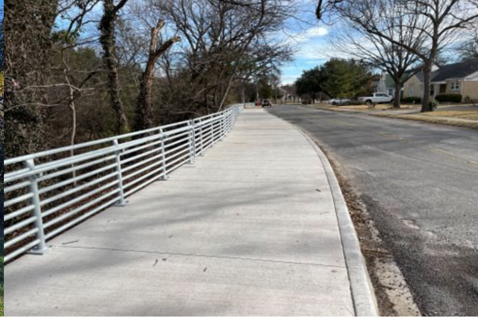
ELMWOOD PARKWAY TRAIL