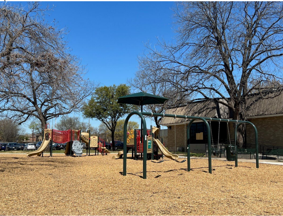
MARTIN LUTHER KING JR. PARK