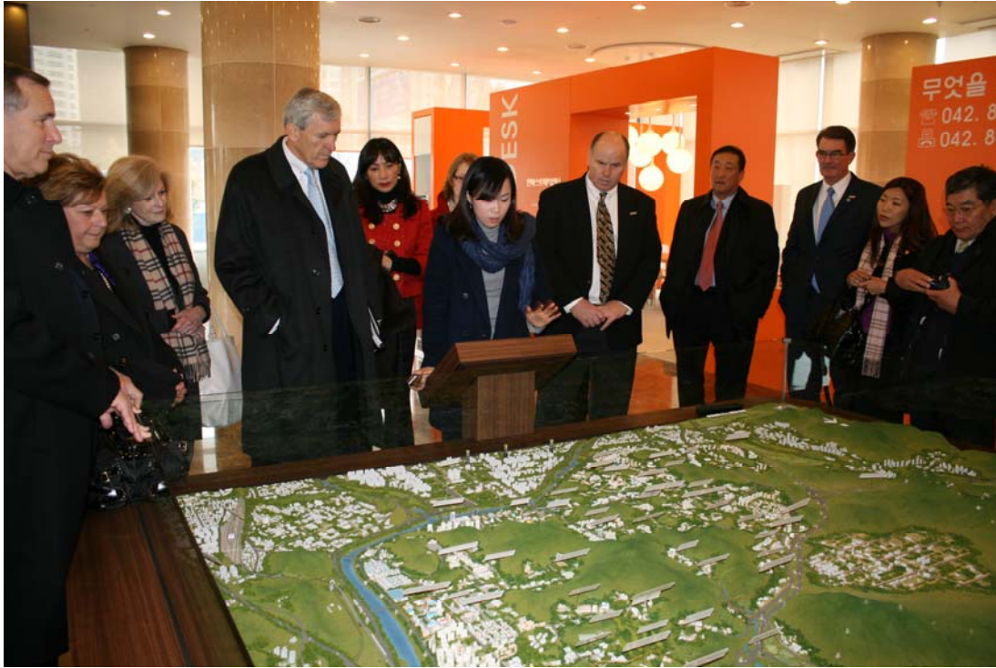
Above: Delegation at Daedeok Innopolis