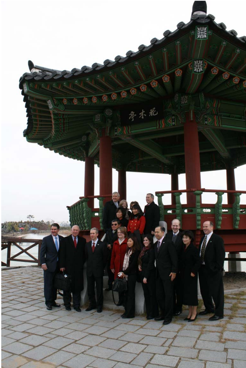
Above: Delegation at Daejeon