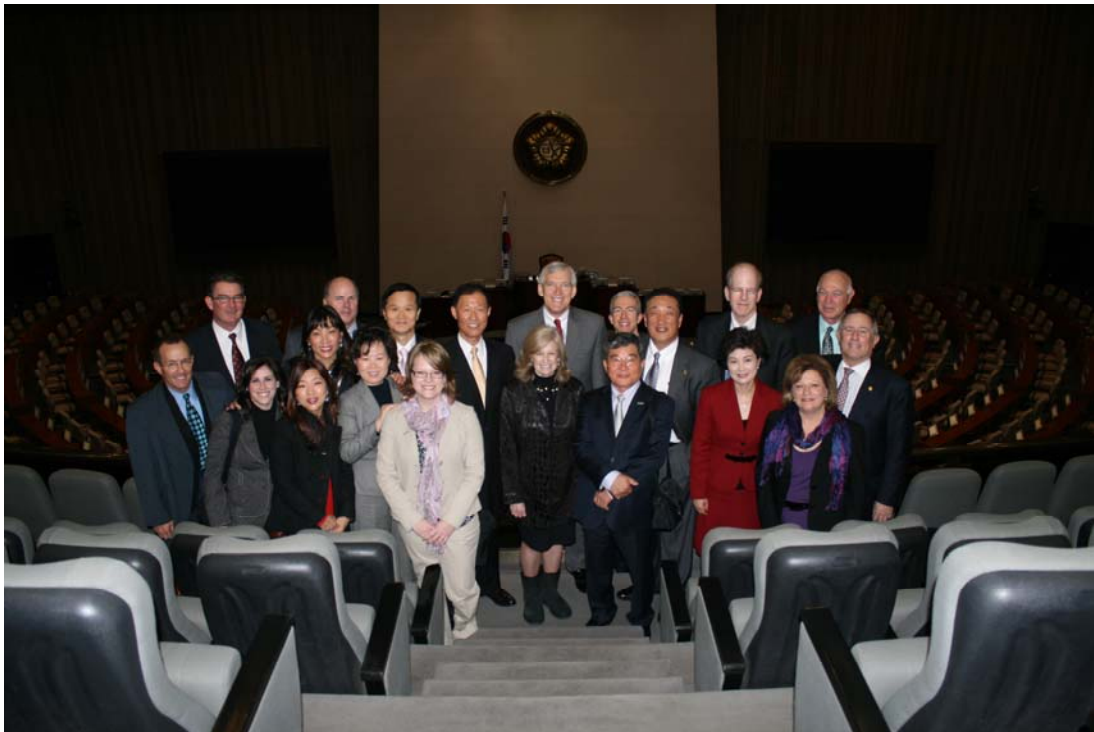
Below: Delegation at National Assembly, Seoul