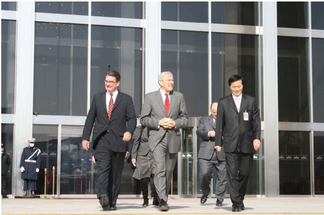
Below: Leppert leaving National Assembly, Seoul