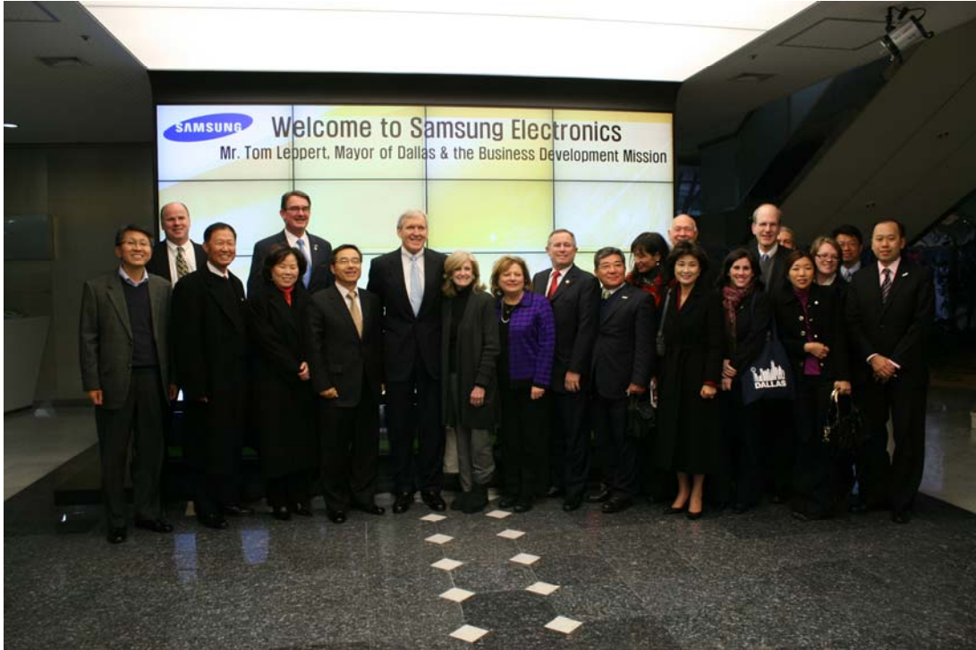
Above: Delegation at Samsung, Suwan