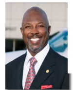
Tennell Atkins Council District 8