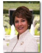
Pauline Medrano Deputy Mayor Pro Tem Council District 2