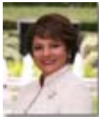
Pauline Medrano Council District 2