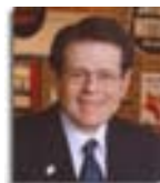
Mitchell Rasansky Council District 13