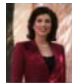
Angela Hunt Council District 14