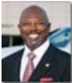
Tennell Atkins Council District 8