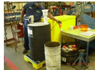
Yes – Dispose of punctured can as scrap metal