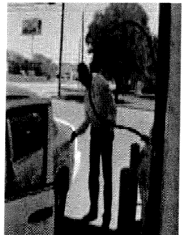
Yes—Always replace cap.