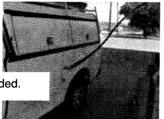
Yes—Never leave nozzle unattended.