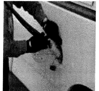
No—Do not top off tank.