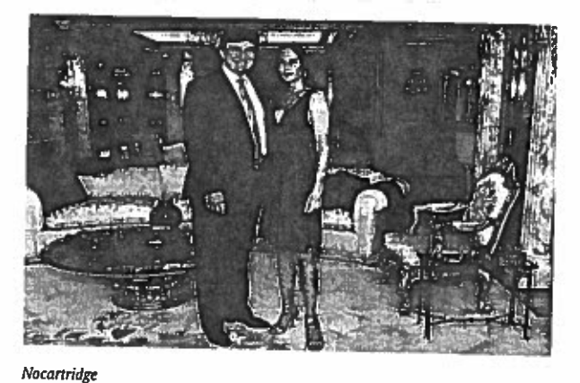
[Pics] Peek Inside The Lavish Residences Of The Trumps