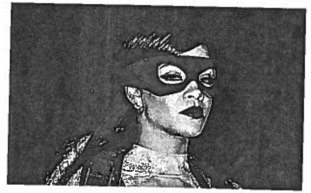
Hooch Celebrity Halloween Costumes That Caused Outrage