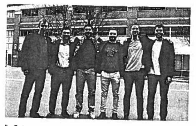
EverQuote Dallas, Texas: This Tiny, Unknown Company is Disrupting A $200 Billion Industry