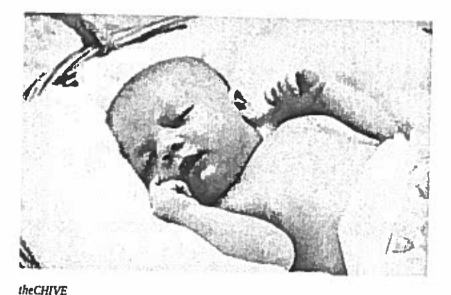
Baby Facts: These 25 Amazing Facts About Bables Will Surprise You