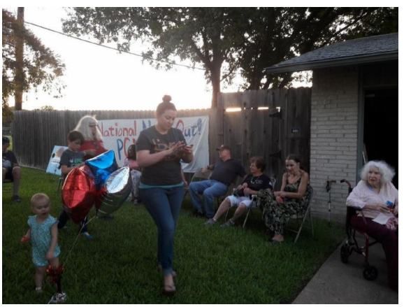
Park Central Neighborhood Association