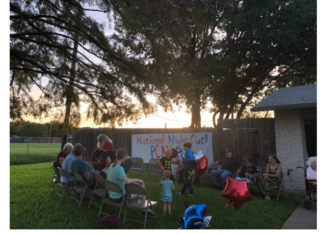
Park Central Neighborhood Association