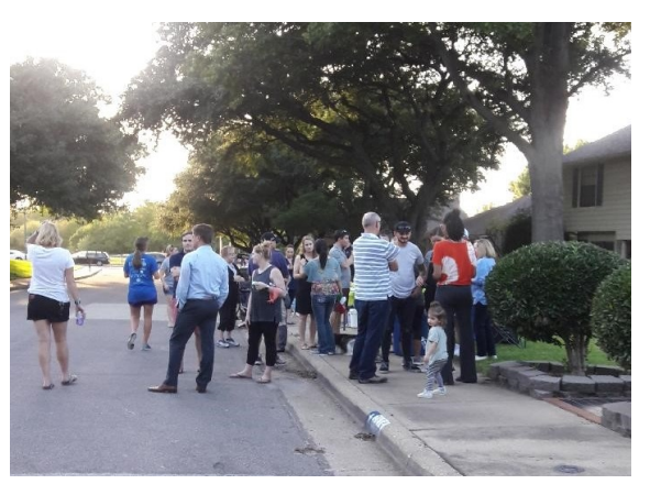
Flame, Breeze, Wind Neighborhood

Thank you to everyone who attended the National Night Out events!