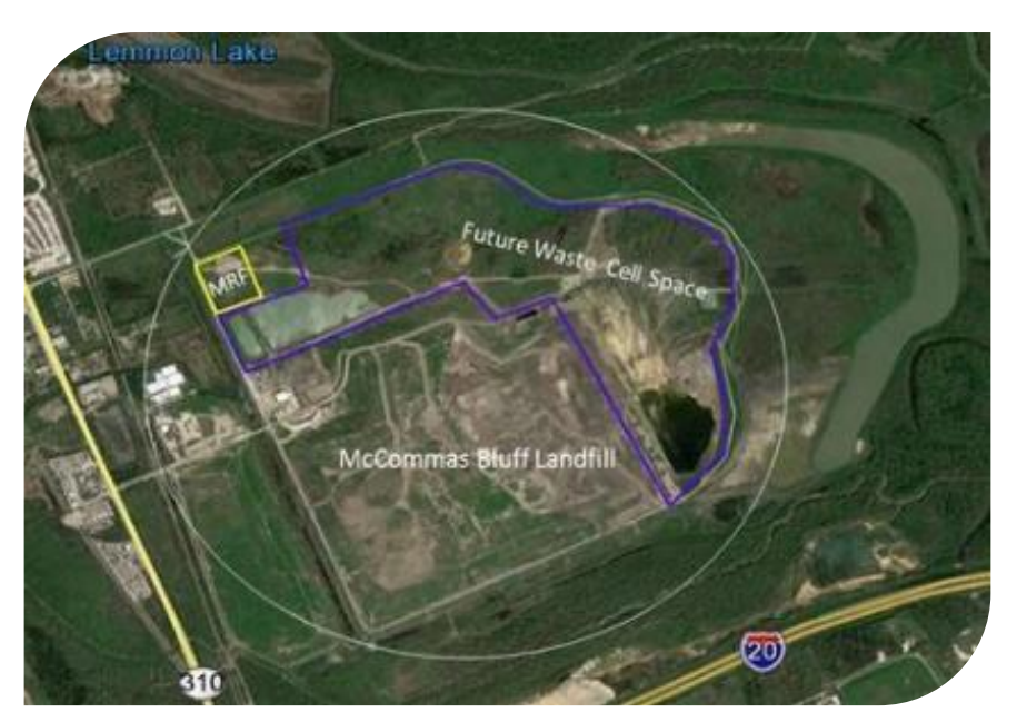
MRF Within the Landfill