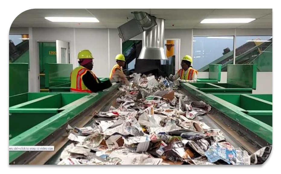
Paper Quality Control Sorting