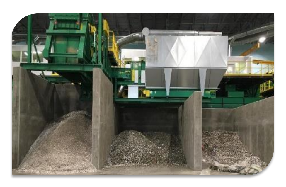
Glass Sorting System