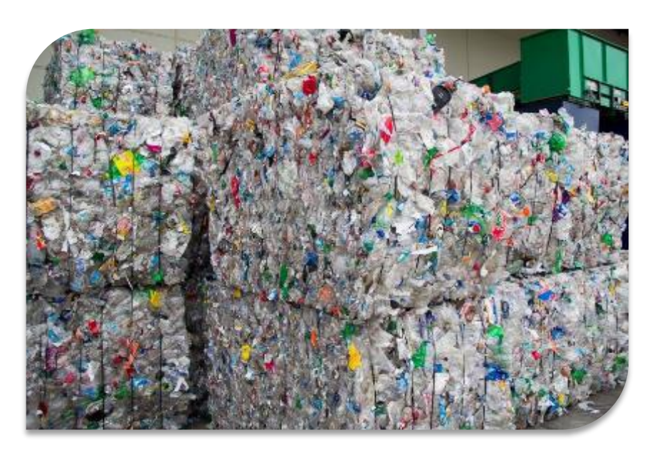
PET #1 Bales