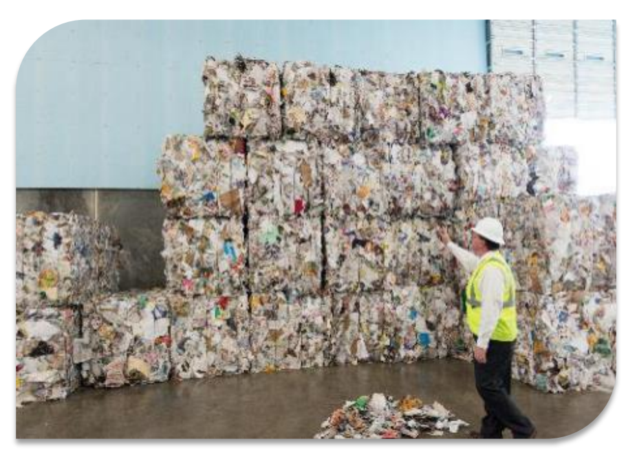
Mixed Paper Bales