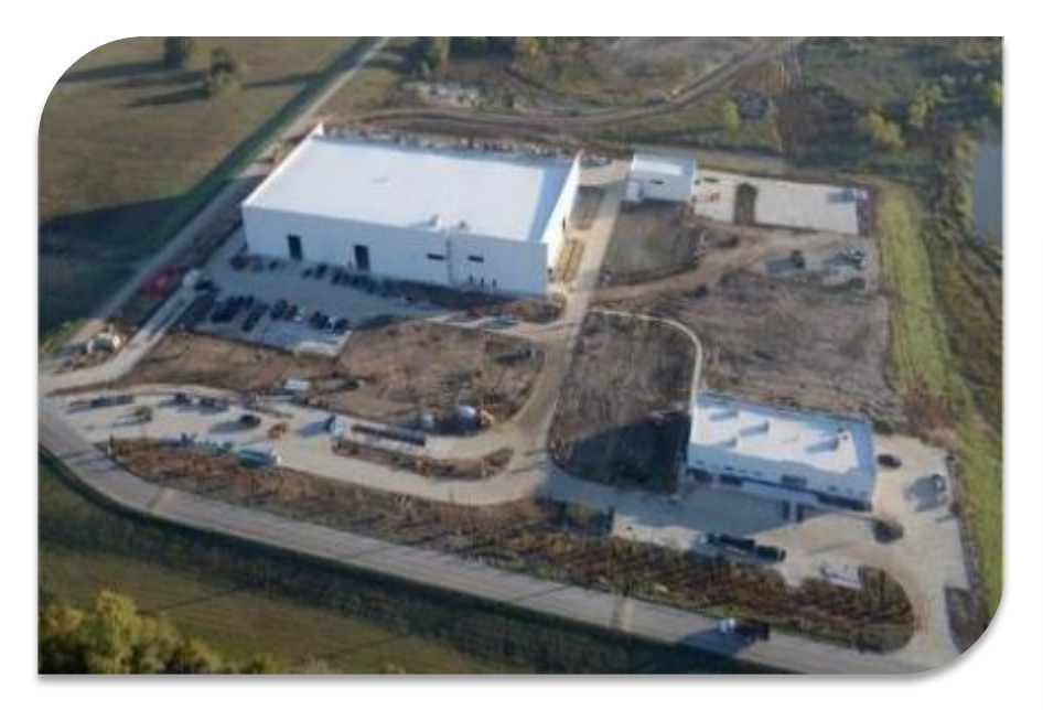
All Buildings Constructed