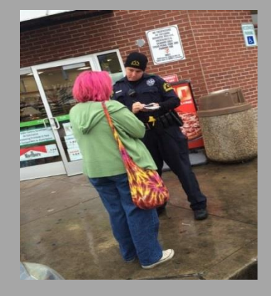
Analyze critical needs to identify efficiencies to ensure core services are met