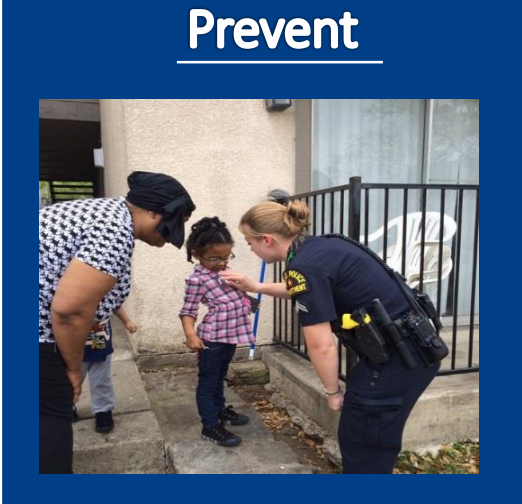
Foot Patrols Enhance community engagement Private Sector Partnerships Increased visibility