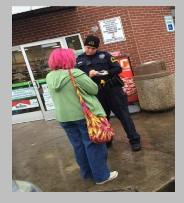
Analyze critical needs to identify efficiencies to ensure core services are met