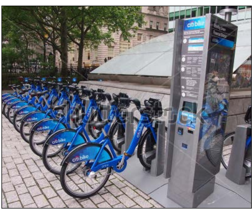
Citi Bike: New York City