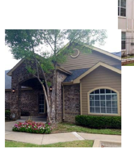
Parks At Cliff Creek