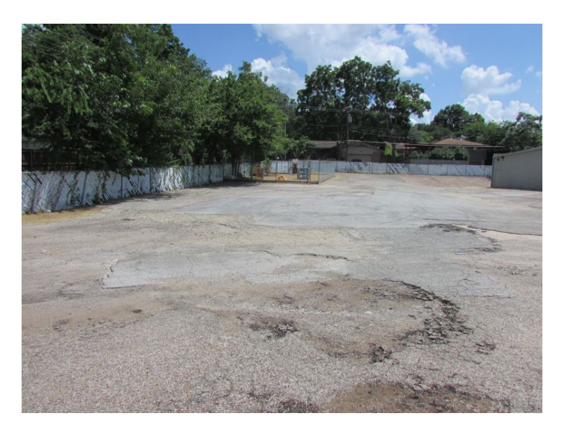
Deteriorated site conditions