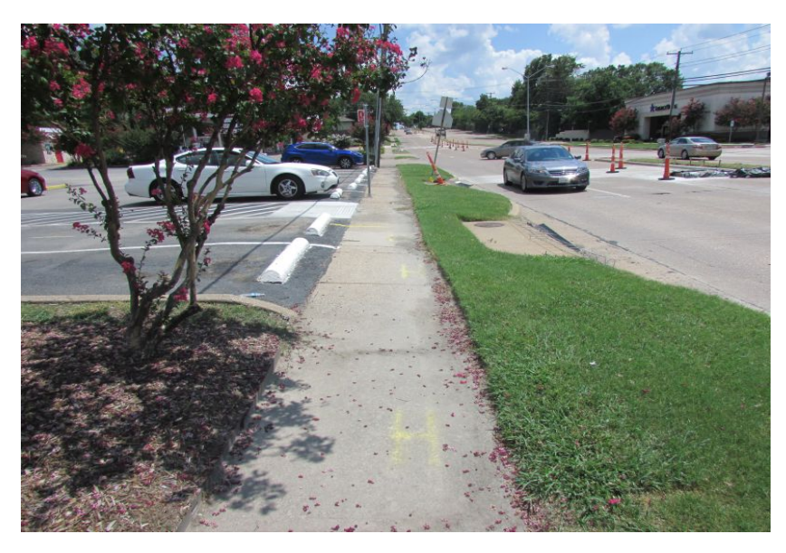
Narrow sidewalks on busy arterial road