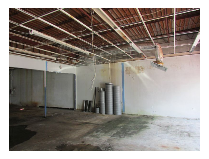
Deferred maintenance – vacant space