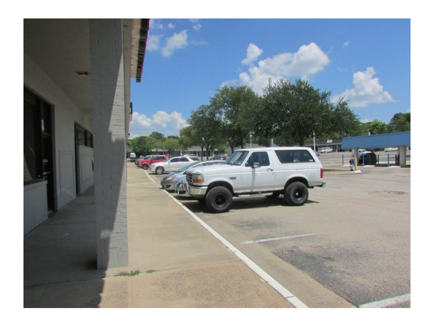
Plain, auto oriented storefronts