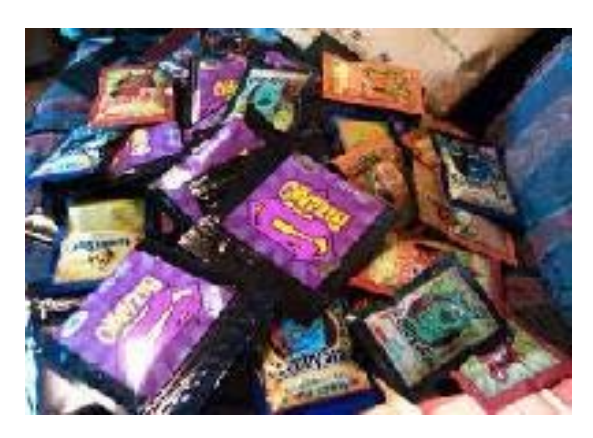
3g pack - $20 /$30 (Smoke Shops) 10g pack - $40 /$50 (rarely seen)