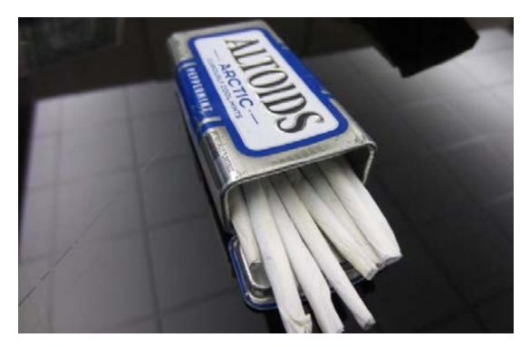
Cigarettes - $5 avg.