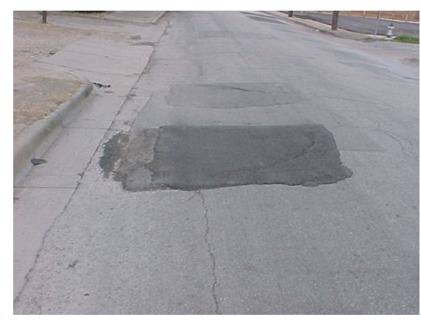
Temporary Repair to Asphalt Street