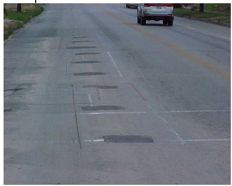
Allowed Before Ordinance