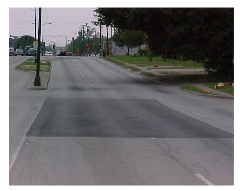
Required by Ordinance