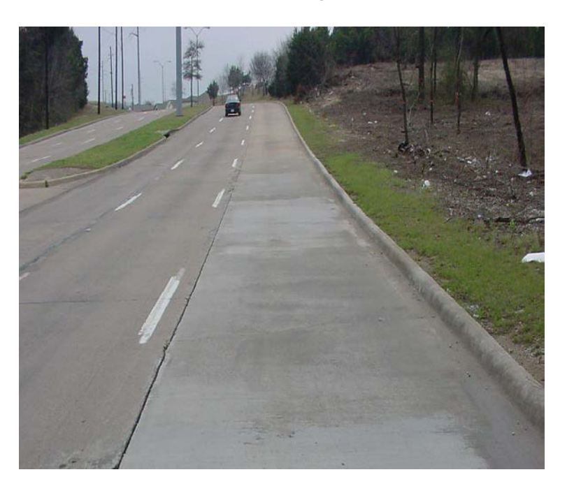
Full lane replacement required by ordinance