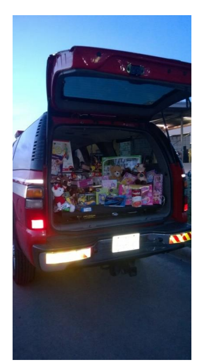
American Red Cross Dallas Area Chapter