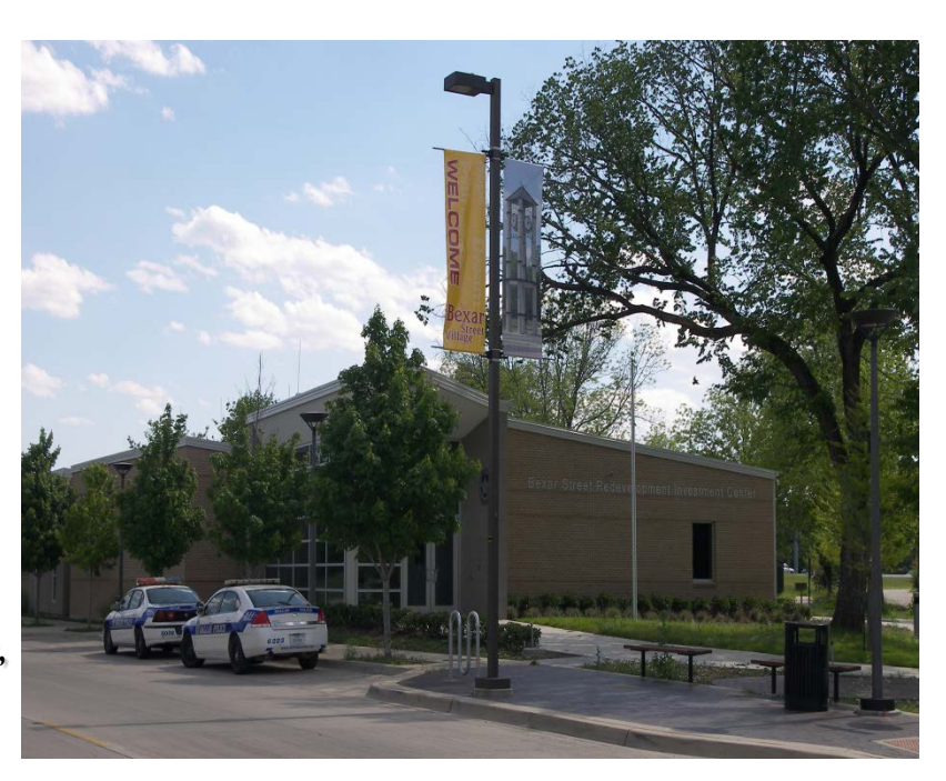
DPD Bexar Street Redevelopment Investment Center