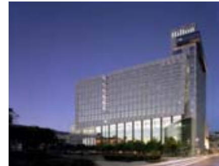
Houston Convention Center Hotel