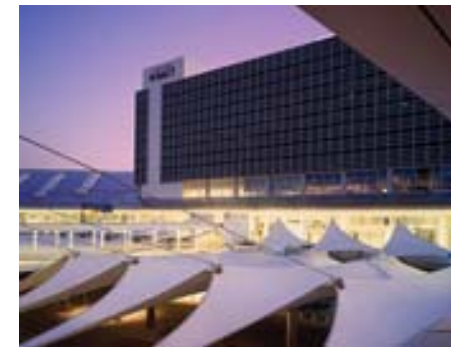
DFW Airport Grand Hyatt Hotel