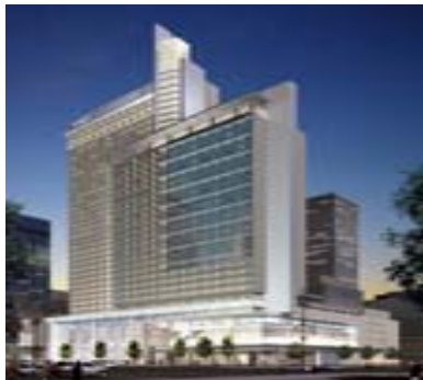
Denver Convention Center Hotel