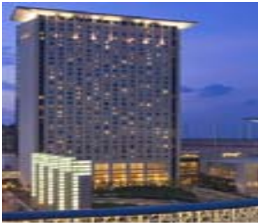
McCormick Place, Chicago