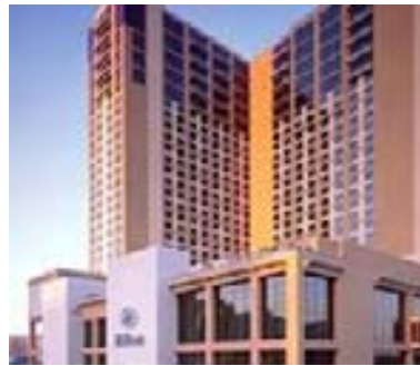
Austin Convention Center Hotel