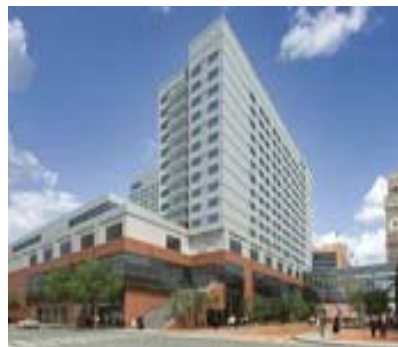
Baltimore Convention Center Hotel